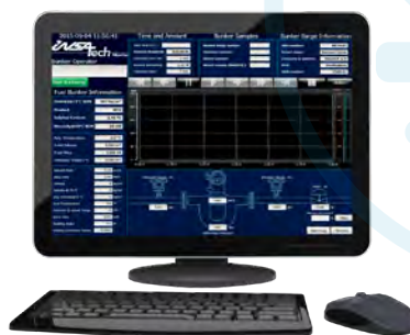
Operator touch screen