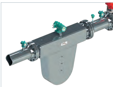
Coriolis mass flow meter