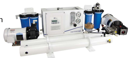
Aqua Whisper Pro - modular