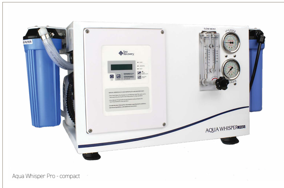
Aqua Whisper Pro - compact

The Aqua Whisper Pro watermaker is suited for charter, offshore fishing, and ocean cruising. Its traditional manual functions and touch-pad control panel allows simple operation and digital + analog instrumentation for redundancy. The Aqua Whisper Pro's high pressure pump is engineered to be quieter than conventional high pressure pumps, and operates for 2,500 hours before any maintenance is required.