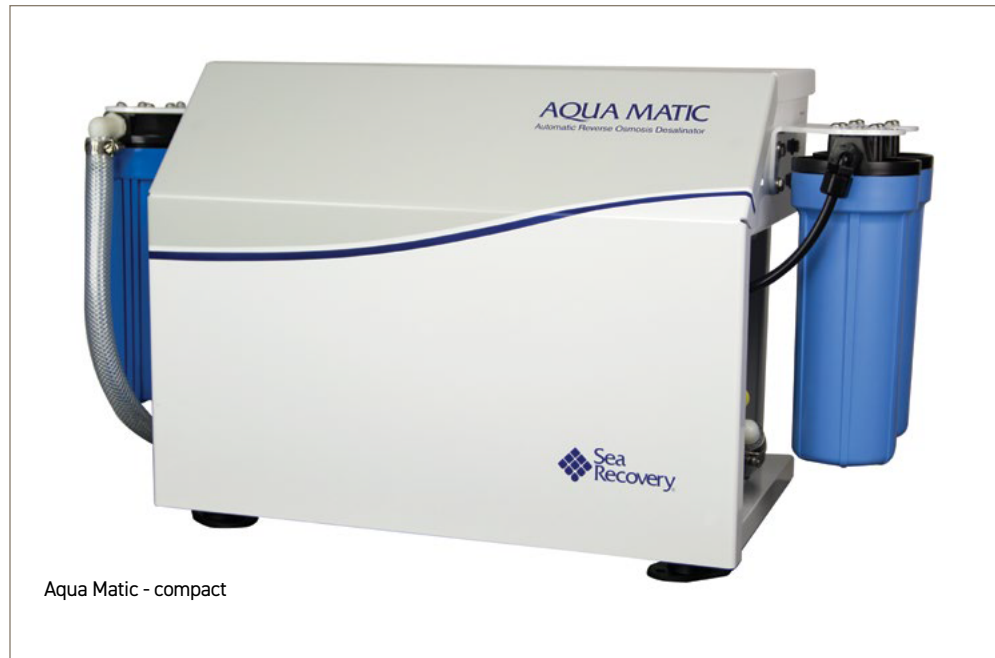
Aqua Matic - compact

The Aqua Matic watermaker features automatic operation with a touchscreen control panel that allows simple touch-and-go operations. Product water quality is now displayed in a bar graph format. Regulation and monitor systems function without the need of an operator. Sea Recovery's high-pressure design includes double O-ring seals on duplex stainless steel fittings to ensure leak-proof operation.