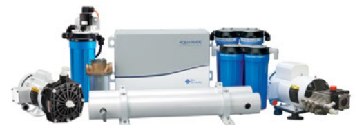
Aqua Matic - modular