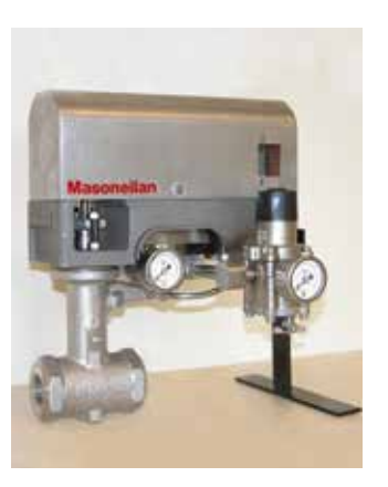
Varipak full Stainless Steel