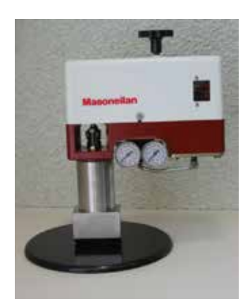
High Pressure Varipak