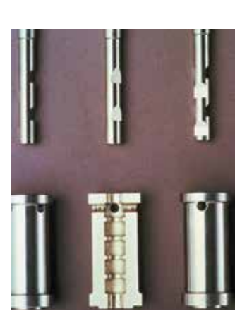
Varilog Trim Subassembly