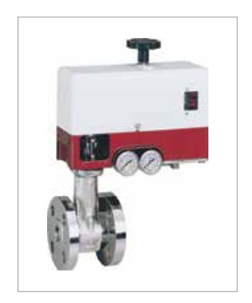
Optional Flanged Varipak Control Valve